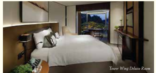
Tower Wing Deluxe Room

The hotel offers 792 luxurious guestrooms and suites across three distinct wings. An additional 127 serviced apartments and 55 residences are available within the property for extended stays.