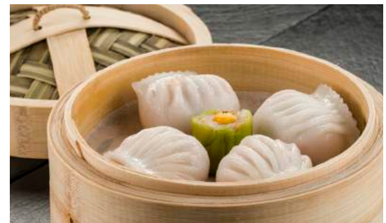
夏宮蝦餃皇 Steamed shrimp dumplings Php 250 4 pieces