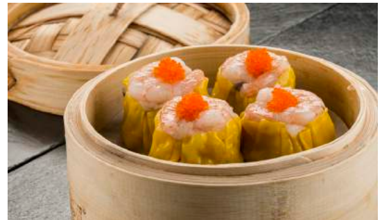
魚籽燒賣皇 Steamed pork siomai with shrimps Php 240 4 pieces