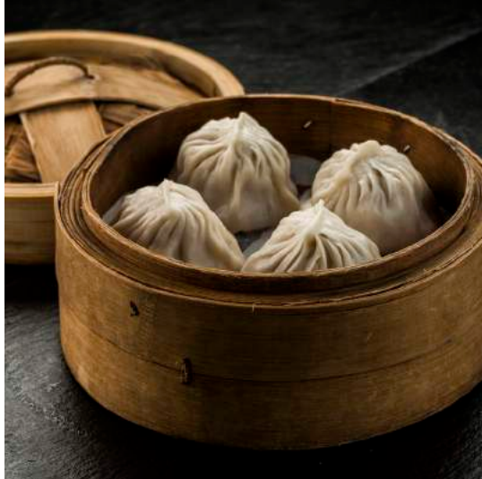
上海小龍飽 Php 195 Steamed xiao Long pao 4 pieces