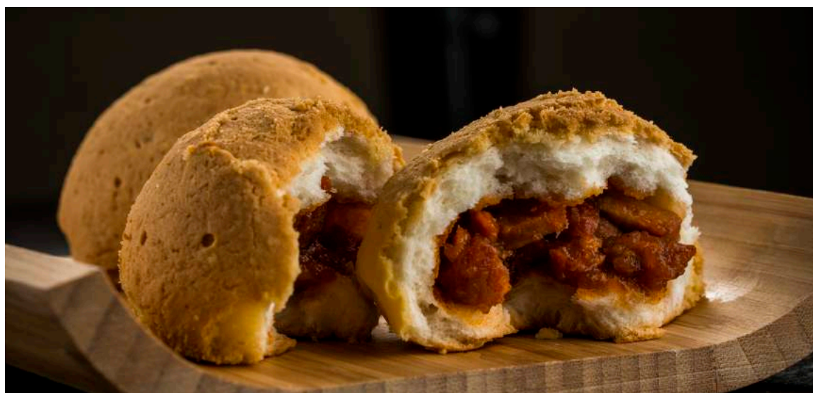
焗波蘿飽 Baked barbecued buns