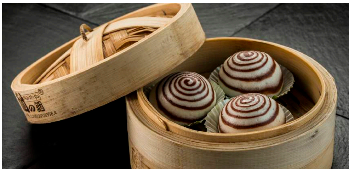
蒸流皇奶油飽 Steamed egg custard buns