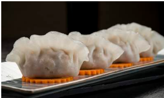
上素蒸粉果 Steamed vegetarian Teowchew dumplings