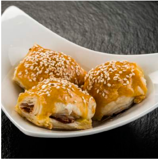
香麻叉燒酥 Baked pork pastries