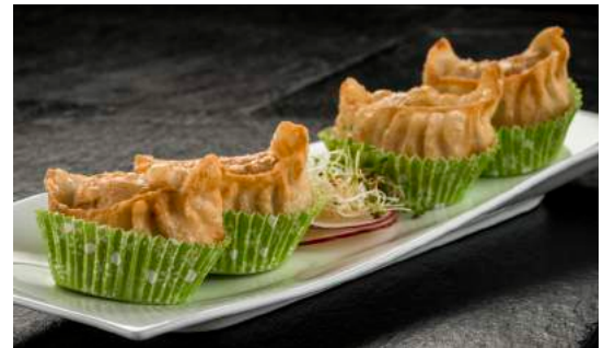
煎上海鍋貼 Pan-fried Shanghai dumplings, "Shanghainese style"