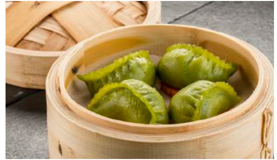
鮮蝦菠菜餃 Steamed spinach dumplings with shrimps Php 200 4 pieces