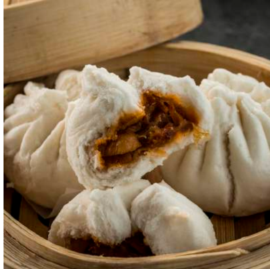
蠔皇叉燒飽 Php 245 Steamed barbecued pork buns 3 pieces