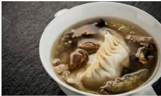
鮑魚仔高湯餃 Baby abalone dumpling bouillon