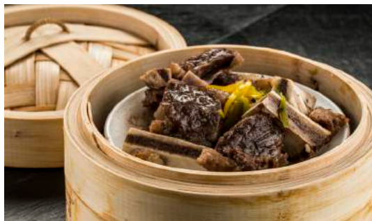
蒸黑椒牛仔骨 Steamed Wagyu beef short ribs Php 285