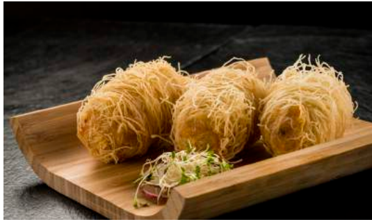
金絲龍蝦卷 Fried lobster rolls