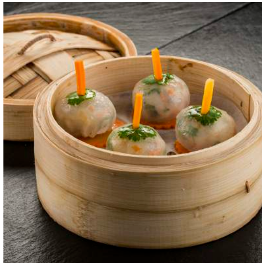
蚵柳香菜餃 Php 220 Steamed crab stick dumplings 4 pieces