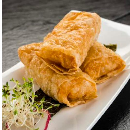
鮮蝦腐皮卷 Fried bean curd skin rolls