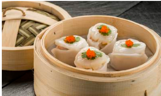
露筍帶子餃 Steamed scallop dumplings Php 240 4 pieces