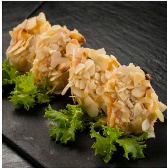
炸双蛋杏仁卷 Deep-fried two kinds of eggs with almond seeds