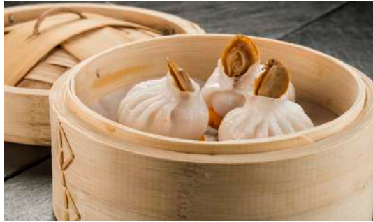
蒸鮑魚仔蝦餃 Steamed baby abalone dumpling Php 470 3 pieces