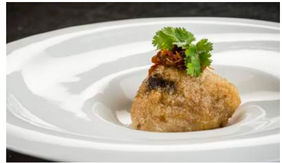
X.O. 福建肉粽 Steamed glutinous rice dumpling in X.O. sauce