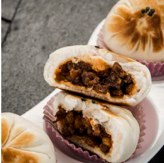
香煎梅菜火鴨飽 Pan-fried duck meat buns