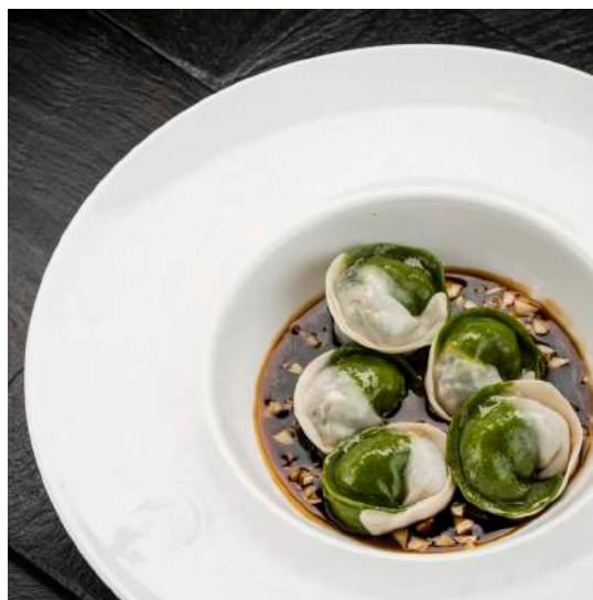
西洋菜餃子 Poached watercress vegetables dumpling