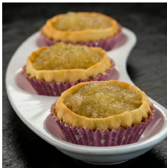
焗燕窩蛋撻 Baked bird's nest egg tart