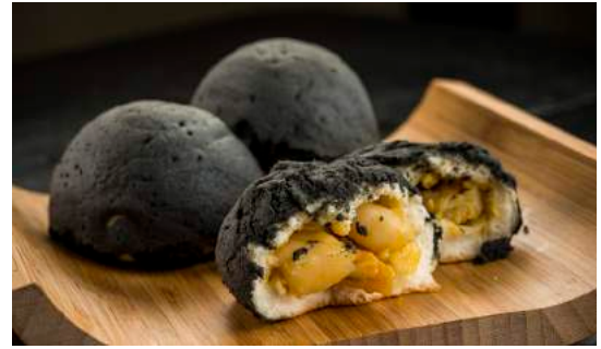
焗海鮮炭飽 Baked charcoal bun with seafood