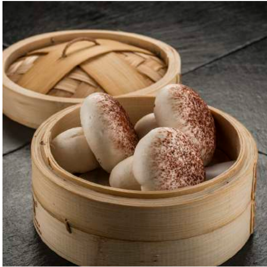
椰干冬菇飽 Php 185 Steamed mushroom bun stuffed with desiccated coconut 3 pieces