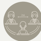
KEEPING A SAFE DISTANCE