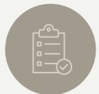
SHARING IS CARING