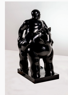
Man on Horse, 2010

Inspired by pre-Columbian and Spanish-colonial art and the murals of Diego Rivera, Botero trained in Madrid and Florence, later refining his iconic style in New York and Paris. His paintings and monumental sculptures capture everyday life with whimsy and grandeur.