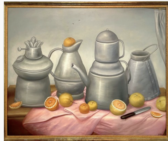
Still Life, 1974