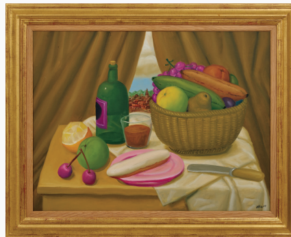
Still Life with Bottle and Fruits, 2004

We invite you to take your time, immerse yourself in the compositions, and appreciate the whimsical elegance that makes Fernando Botero's art unforgettable.