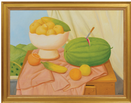
Still Life with Watermelon, 2018

Visitors will encounter the beauty and humour of Botero's works, and step inside the stories that shaped them.