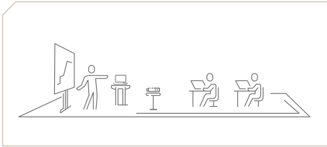
DESIGN 1 ONE ROOM

Our meeting designs can incorporate a virtual stream for attendees or presenters that are not able to make the in-person meeting.