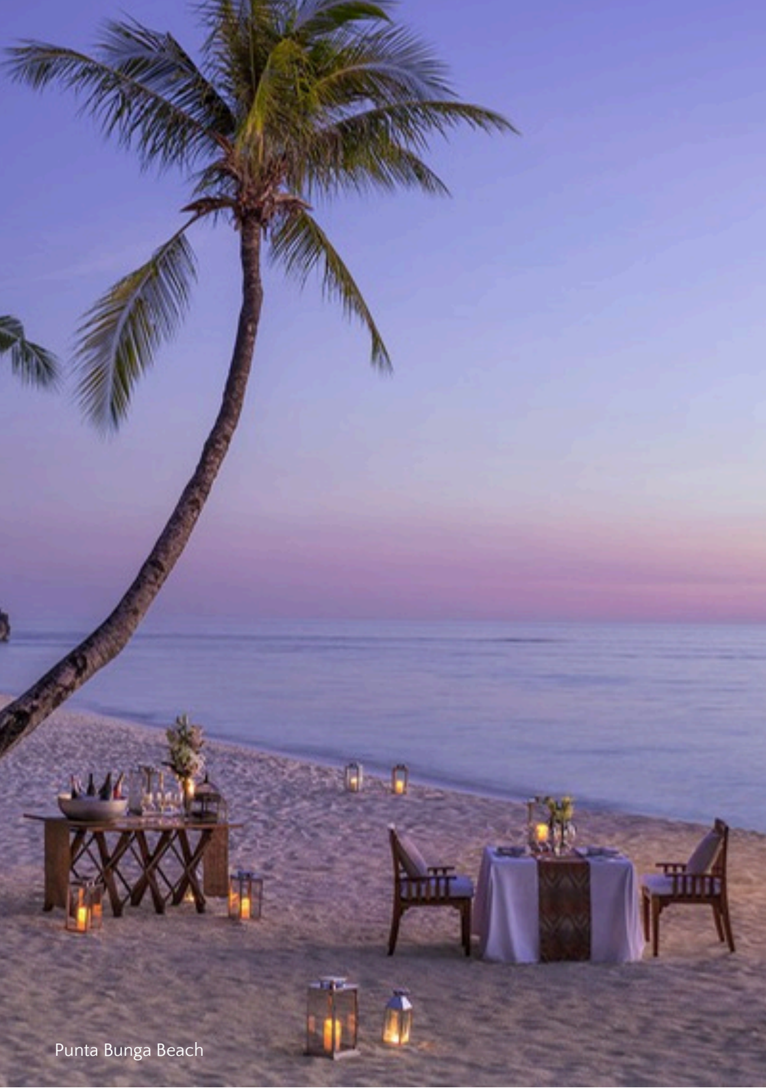
Punta Bunga Beach