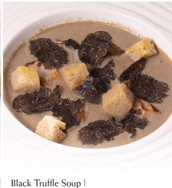
Black Truffle Soup | Porcini Mushrooms | Morels THB 800++

Prices are subject to 10% service charge and applicable government tax.