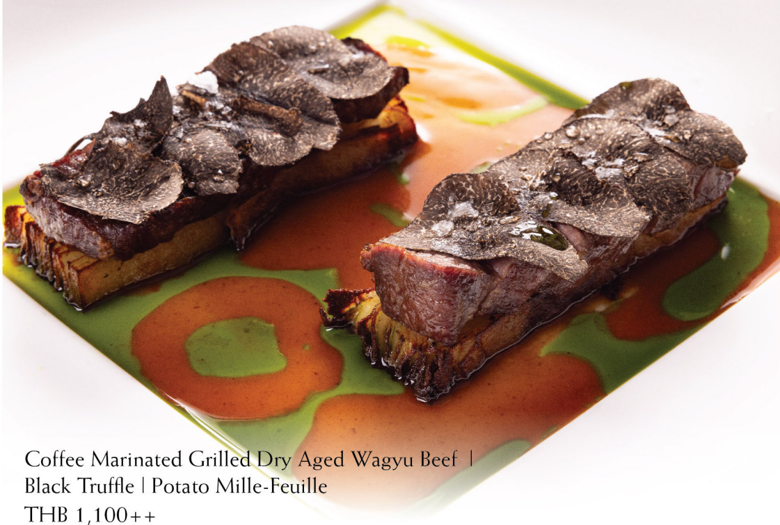
Coffee Marinated Grilled Dry Aged Wagyu Beef | Black Truffle | Potato Mille-Feuille THB 1,100++