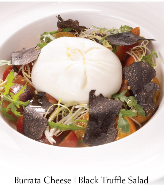
Burrata Cheese | Black Truffle Salad THB 720++