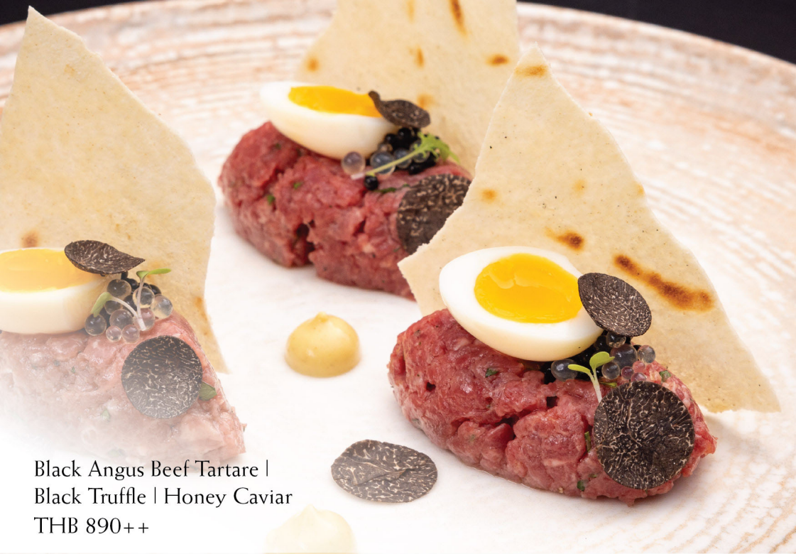
Black Angus Beef Tartare | Black Truffle | Honey Caviar THB 890++