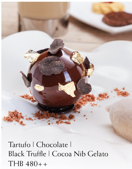
Tartufo | Chocolate | Black Truffle | Cocoa Nib Gelato THB 480++

Prices are subject to 10% service charge and applicable government tax.