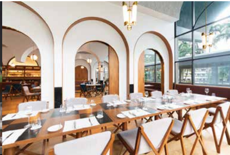
Big Private Dining Room holds up to 24 guests