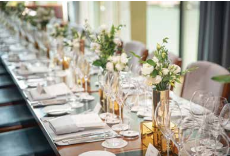
Small Private Dining Room holds up to 8 guests

From intimate gatherings and private social events to invitation-only parties and important business meetings, Origin Grill has a selection of beautifully appointed spaces to best meet your needs whether you are hosting 8 people or 100 people.