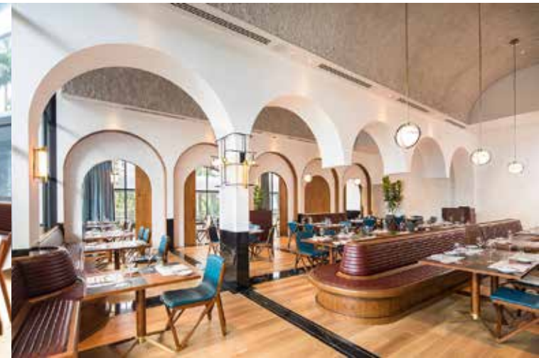
The Main Dining Room holds up to 80 guests