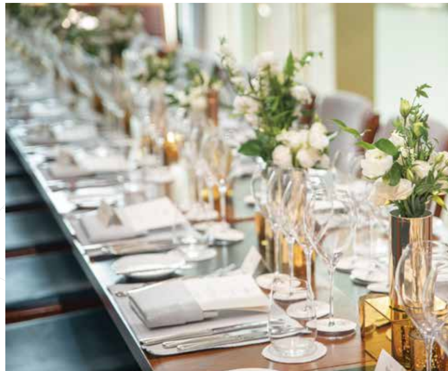
Past Event - Ruinart