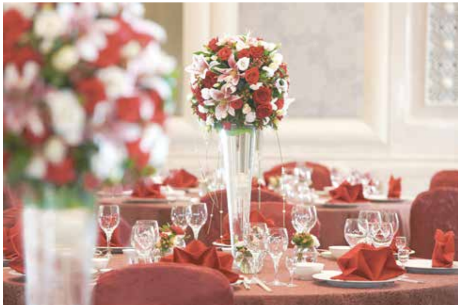
The newly renovated Grand Ballroom and eight function rooms A new concept of design bring on an altogether new aspect of visual perception Advanced audio-visual equipment to meet the diverse needs of events Inspired themed conferences, and wedding packages