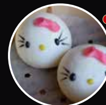
吉蒂猫奶黄包 Hello Kitty Buns with Custard Paste Filling

INCLUSIVE OF 10% SERVICE CHARGE PLUS 6% GOVERNMENT TAX. 以上价格已包括10% 服务费及6%政府税。