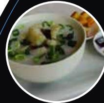
金银蛋鱼肉粥 Fish Congee with Century and Salted Eggs