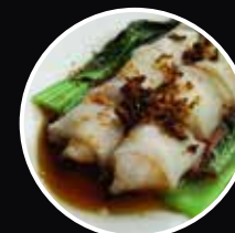
鲜虾肠粉 Steamed Rice Rolls with Prawns