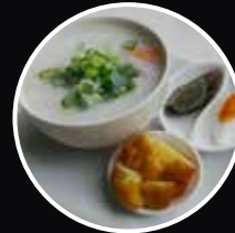
海鲜粥 Prawns and Scallops Congee