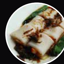
蜜汁鸡肉肠粉 Steamed Rice Rolls with BBQ Chicken