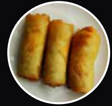
炸素春卷 Deep-fried Vegetarian Spring Rolls