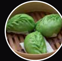
绿茶豆沙包 Green Tea Buns with Red Bean Paste Filling