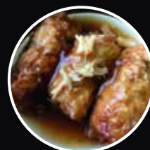
鲜虾腐竹卷 Steamed Bean Curd skin rolls with prawn and chicken