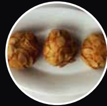
脆杏鲜虾球 Deep-fried Golden Almond Prawn Balls