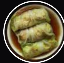
翠玉白菜鸡肉卷 Steamed Cabbage Chicken Rolls