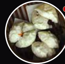
蜜汁 鸡肉叉烧包 Steamed BBQ Chicken Buns