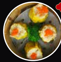
鸡肉烧卖 Steamed Traditional Chicken Siu Mai