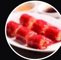
金沙红米肠 Red Rice Rolls with Shrimps