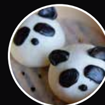
功夫熊猫香兰包 Kungfu Panda Buns with Pandan Paste Filling