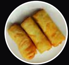
炸鲜虾春卷 Deep-fried Shrimp Spring Rolls