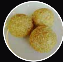
红豆芝麻球 Deep-fried Red Bean Sesame Balls