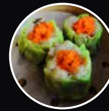
香菇鸡肉烧卖 Steamed Chicken and Mushroom Siu Mai