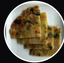
煎葱油饼 Pan-fried Scallion Pancakes