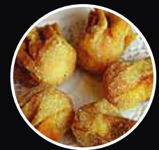
炸虾肉云吞 Deep-fried Prawn Wantons