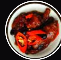
辣味凤爪 Steamed Chicken Feet With Chili