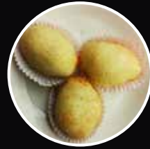
酥炸咸水角 Deep-fried Minced Chicken Dumplings