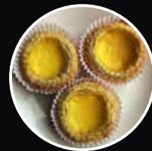
蛋挞 Baked Egg Tarts