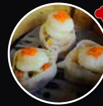
鲜贝蒸饺 Steamed Prawn and Scallop Dumplings