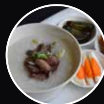
牛肉粥 Beef Congee with Peanuts