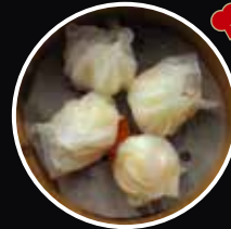
竹笙蒸蝦餃 Steamed Bamboo Pith and Shrimp Dumplings