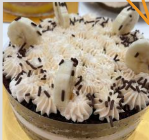
Banutella Chocolate Cake