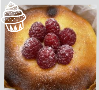
Burnt Basque Cheese Cake